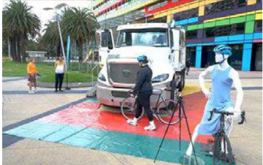
The Docklands Swapping Seats activation invited community members to sit in the driver's seat of a construction truck and experience its blind spots first-hand.

We invite you to share our safety messages with your local communities and network. If you would like to receive a campaign stakeholder pack with shareable content and creative assets, please get in touch.