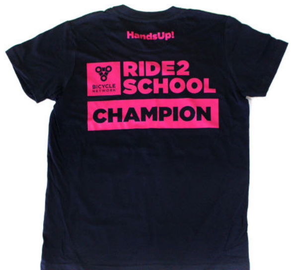
Ride2School Champion t-shirts for students to wear during their role